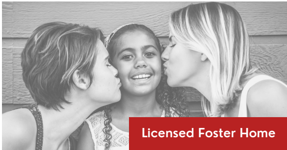
Licensed Foster Home

There are many ways to get involved with Jenda Foster Care, before or after placement of a child in your care! We provide services to help you obtain your Foster Care License and provide support and services after placement. Ask Jenda more about your options for providing care!